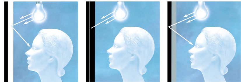
A: Complete Hiding— Light Scattering